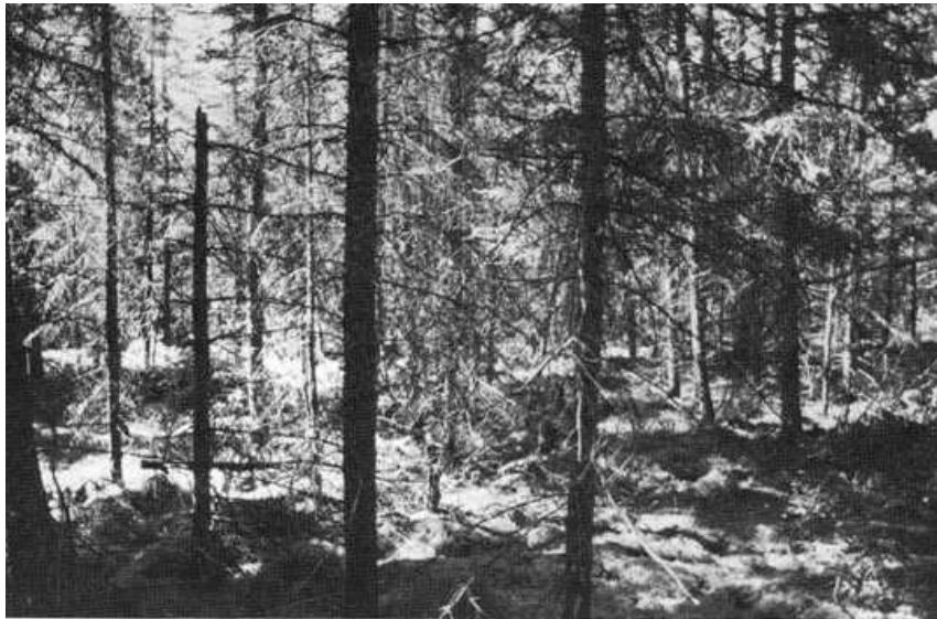
Photo 2. Closed Black Spruce-Tamarack forest with a ground cover of mosses.

A patterned bog complex extends in a broad band through the centre part of the bog to the west of, and roughly parallel to, the Horse Creek drain. Smaller areas of patterned bog occur elsewhere, notably just east of Horse Creek and further to the west near the town described as the Manion Corners Long Swamp fen (Reddoch 1978). In Alfred Bog, the forest openings are much larger (up to 300m x 50m versus 50m x 15m), and the total area of patterned bog is far more extensive (covering about 200 hectares or 500 acres).