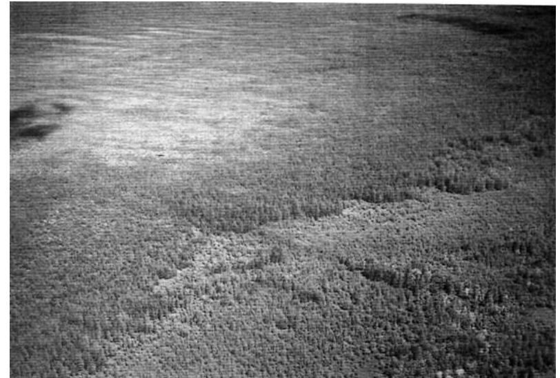
Photo 3. Aerial view of four major bog vegetation types, gray birch/tamarack/tall shrub (lower right corner), tamarack/tall shrub (lower right), black spruce (lower left corner to upper right), and patterned bog (upper left).