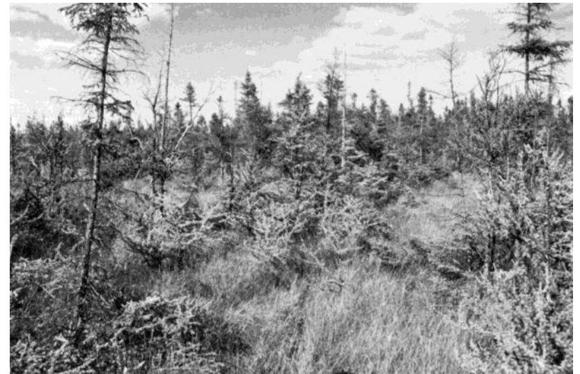
Photo 4. Very open, stunted spruce-tamarack forest and sedge meadow patterned bog. Some of the bog's most handsome orchids, including the White Fringe-orchid, grow in and about the edges of these sedge-dominated bog openings.