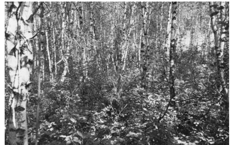
Photo 5. Gray Birch wood with a dense under story of tall shrubs: Nannyberry, Mountain-holly and Winterberry.

Forests dominated by Gray Birch tend to be restricted to the periphery of the bog but in places extend well out into it. Saplings are widely scattered throughout the open bog sections. Gray Birch probably represents a successional community following disturbance (drainage and/or fire). With the Gray Birch, there is generally a small amount of Red Maple. Beneath the forest canopy and occupying openings in it is a rather dense shrub layer consisting mainly of Mountain-holly, Nannyberry, Winterberry and Black Chokeberry. (See Figure 5) On the ground grow a number of herbs characteristic of lowland forests, such as Gold-thread and Spinulose Wood Fern. Sphagnum and other mosses are frequent but do not form the continuous, deep, hummocky mat found in the more open section of the bog. In Ontario, Gray Birch is confined to the easternmost part of the province (the Ottawa – St. Lawrence Lowland) where it is a common species in successional forests. It invades areas quickly following fire, and this may be the reason for its prevalence in Alfred Bog as well as in some other eastern Ontario wetlands.